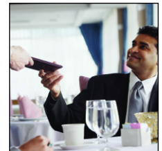
Ideal for Pay-at-the-table

Truly designed for maximum performance, the Optimum M4240 features new "Power-Amp" Bluetooth technology, providing the best connectivity over the greatest distance, even through barriers and obstacles that may exist at the merchant location. The reception and range of the M4240 Bluetooth solution is over double that of competitive models.