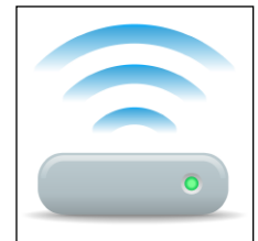
Super long range Bluetooth technology