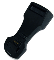
CONVENIENT CHARGING DOCK