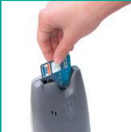
Easy insertion of smart cards by merchants